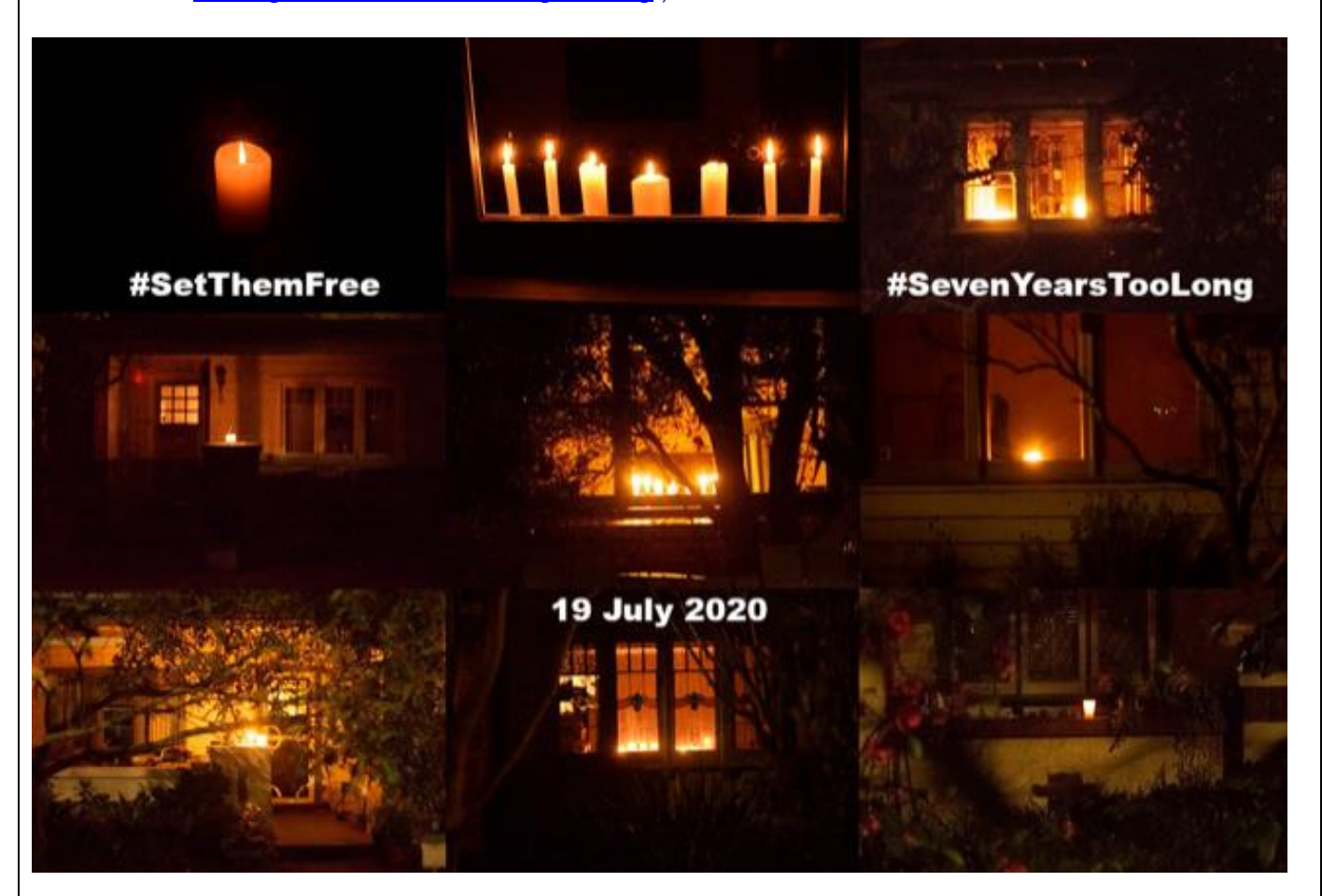
Your vigils – The UNHAPPY ANNIVERSARY 19 July 2020 (See more on the Gallery page of our website <a href="https://www.grandmothersforrefugees.org">www.grandmothersforrefugees.org</a>)