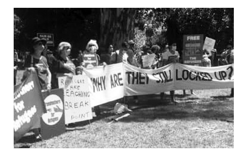
January 2022 www.grandmothersforrefugees.org

3. <u>Contact your local MP</u> and make it clear that you care about this issue: Nine years is too long. A change of policy is needed now.