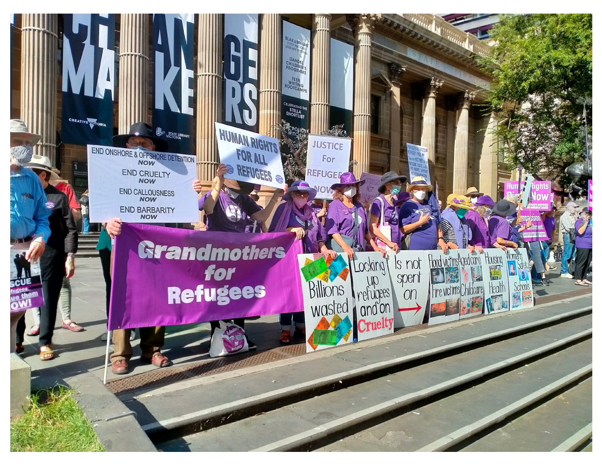
Rallying for change, justice and freedom for refugees