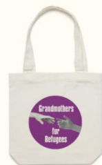
Grandmothers For Refugees Tote $25

Grandmothers for Refugees advocates for compassionate welcome and safe settlement of all people seeking asylum. For every tee purchased, Dai T-Shirt Automal will donate $18 to Grandmothers for Refugees and $9 for every tote.