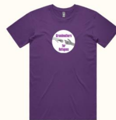
Grandmothers For Refugees Tee $40