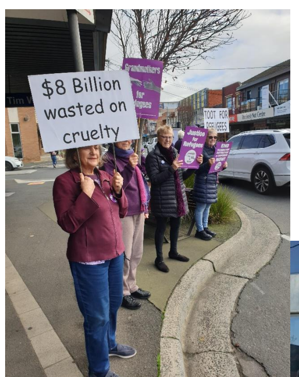
Goldstein grandmothers know waste when they see it!